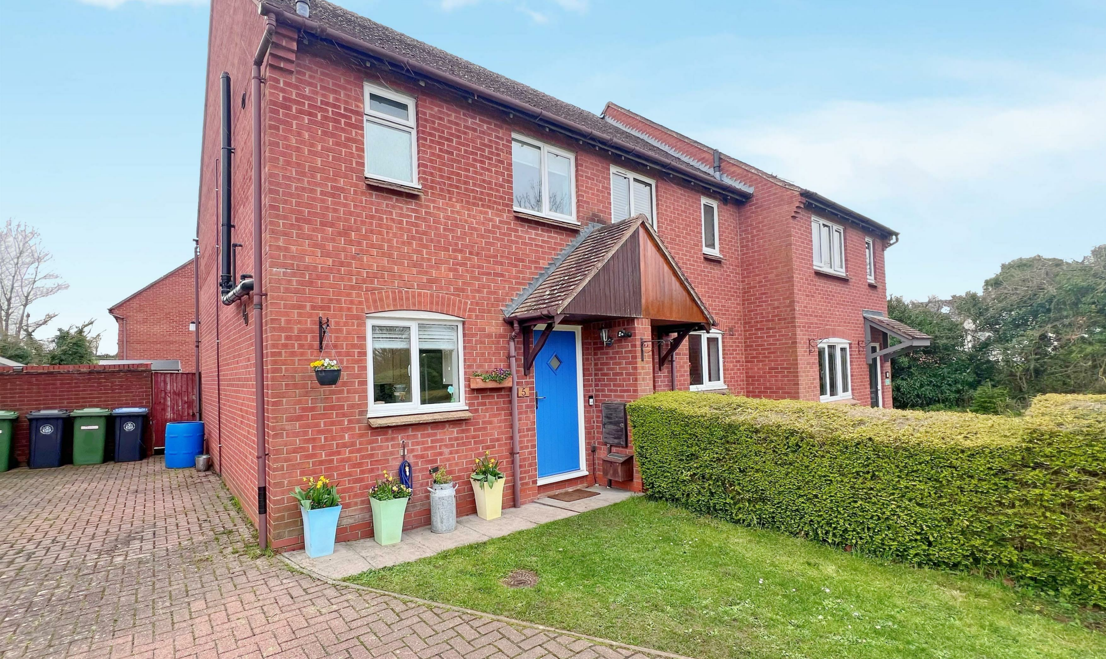
Holland Meadow , Welford on Avon Stratford-upon-Avon, CV37 8JD